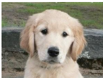
Greetings from Sully!

Taming the Water — Wave reporter Jackie, Session 2